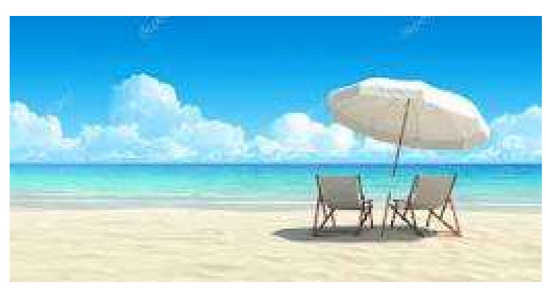
Have a nice Summer!