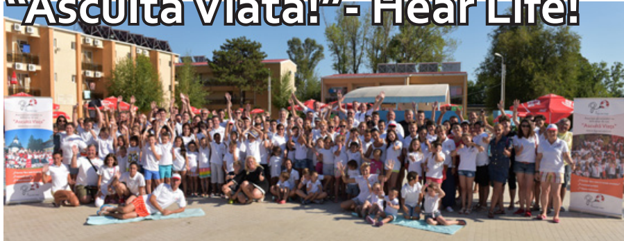
text Cosmin Brasov, pictures Iulian Dumitru