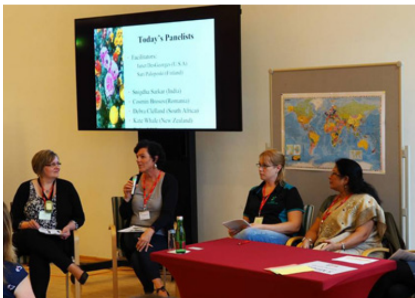
text and pictures Petra Paloposki