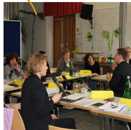
text and pictures Nicole Schilling

The theme of the project "The Beauty of Difference" is to create an opportunity for self-expression and exploration of a new culture, as well as to stimulate the development, social inclusion and active participation of young people with hearing disabilities in society. The project is an international exchange involving 32 young people, 8 from Bulgaria, Lithuania, Poland and Romania with hearing impairment. The exchange is ten days long and will take place at the end of September 2018 in Tsarevo Municipality, the southern Black Sea coast. Among the main topics that young people from the four countries will discuss are European and local policies for people with disabilities, good practices, the role and importance of education and empowerment, advocacy and its role